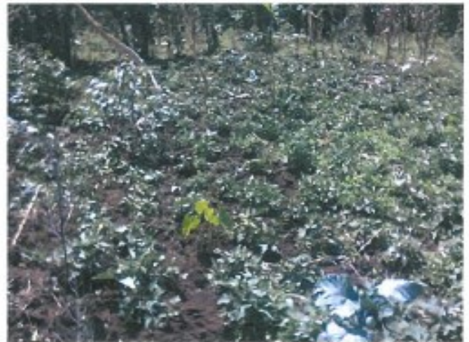
A well grown sweet potato farm