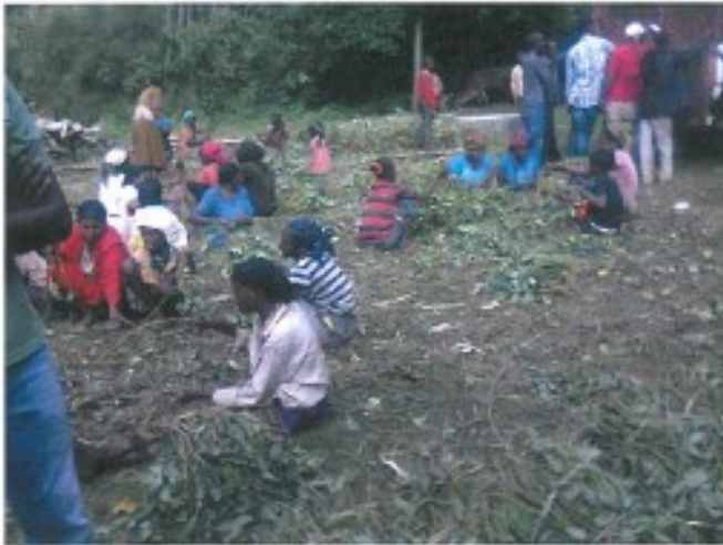
Distribution of sweet potato seedlings

“Plan was our crucial partner during our emergency support needs last year. We survived the emergency due to its support. Plan has also been supporting us this year to recover from the effects of emergency having our own food production. The seeds and fertilizers provided to us meant a lot to help us stand on our own” explained Geldida T. 45, a resident in the community.